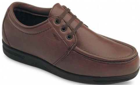
Red wing 6604 / 6602 (Brown)

LEATHER TYPE: Full Grain LEATHER NAME: Black Mustang Leather CONSTRUCTION: Cement INSOLE: Cushion with 3/4 Leather Sock Liner LAST: 201G OUTSOLE: Urethane Wedge NON-MARKING: Yes COUNTRY OF ORIGIN: Made in the USA with Imported Materials SAFETY RATING: ASTM F2413-11, M I/75 C/75, SD CARE PRODUCTS: Leather Protector,Shoe Creme